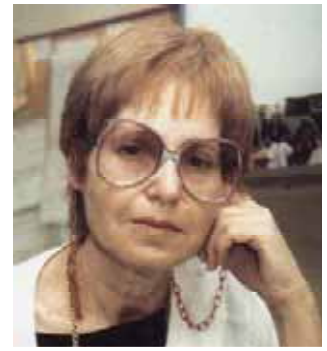
Pro. T. Rosenthal

The CRDH rat is a unique animal model in which genetic spontaneous hypertension and type 2 diet-induced diabetes developed after cross-breeding between the Cohen Diabetic sensitive (CDs) substrain and the Spontaneously