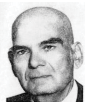
Prof. A.M. Cohen

The Cohen Diabetic rat is a genetically derived experimental model of diet-induced type 2 diabetes mellitus that reproduces many features of the disease in humans (13; 14). This model stands out among other experimental rodent models of type 2 diabetes mellitus in several important ways. Its most outstanding and distinctive feature is the absolute dependence